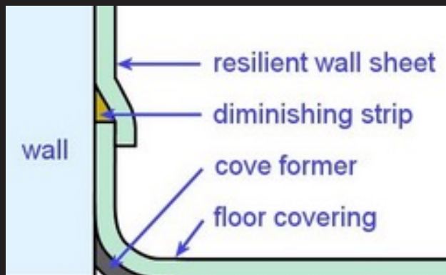
Figure: Overlap Method 1