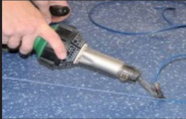
Figure: Hot Welding Vinyl Floor with Weld Rod